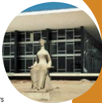
The Supreme Court

The Federal Supreme Court is at the apex of the judicial system. It has its seat in the national capital, Brasília, but holds jurisdiction throughout the country. It is composed of 11 justices, of proven legal and constitutional training and experience, appointed by the President of the Republic, with the prior approval of the Senate.