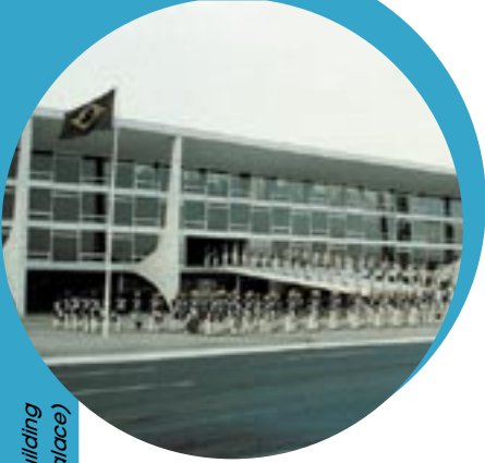
The Presidential office building (Planalto palace)